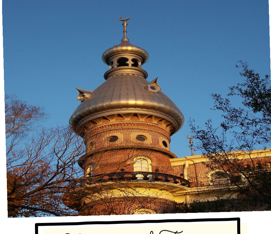
University of Tampa